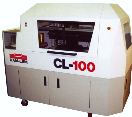
CAM-LEM's automated CL-100 system for manufacturing your ceramic microfluidic components